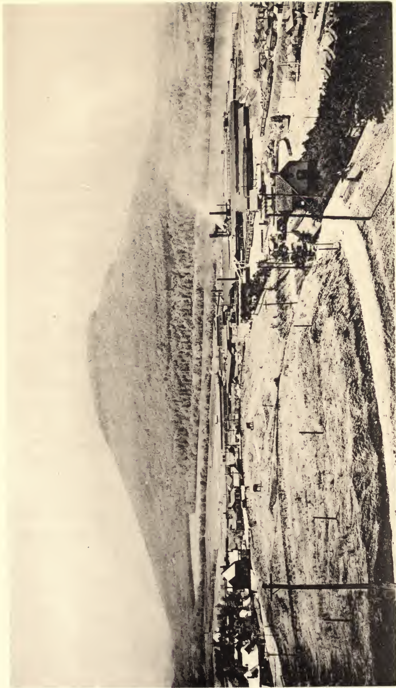
LOOKOUT MOUNTAIN BATTLE FIELD.